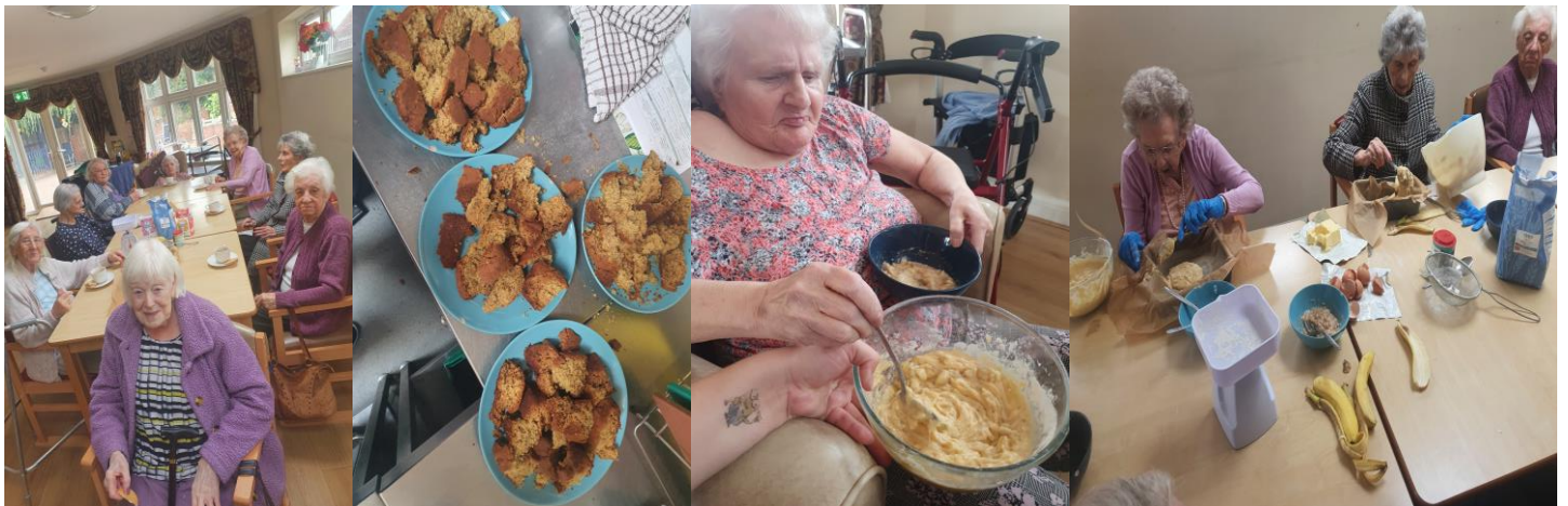
Sourdough September meant bread making for all. A group ladies love baking but we much rather preferred the lovely taste of banana bread