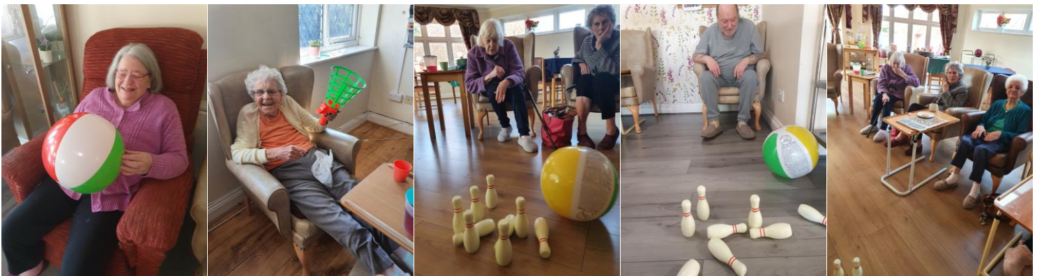
Sports Morning continues almost every week and it's great to see everyone participate and staying active