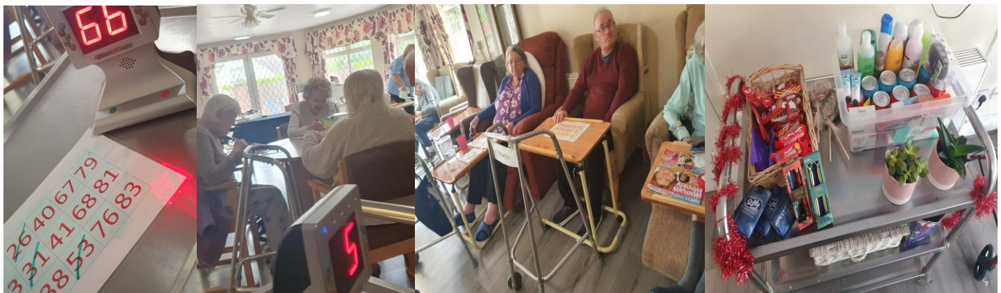
Bingo still remains one of our residents favorite activity and with new prizes this month plenty of people got involved